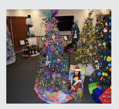
Chesapeake High School's Art class decorated their tree using art supplies and paintings to be displayed during the Festival of Trees & Christmas Market.