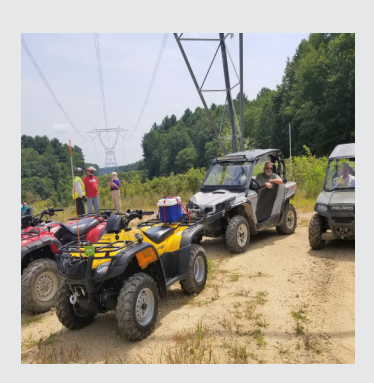
ATV enthusiasts hit the trails at Wayne National Forest, while taking in the scenic views.