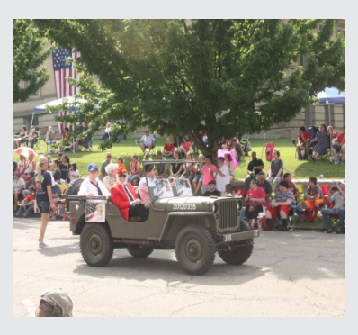
Veterans are honored as they pass by in their Jeep during the 2018 Ironton Memorial Day Parade.

In the upcoming year, we hope to build on these accomplishments and eclipse the achievements we have done thus far.