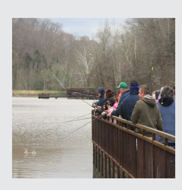
Families enjoy fishing at the Annual Wheelin' Fishing Derby at Wayne National Forest's Lake Vesuvius.